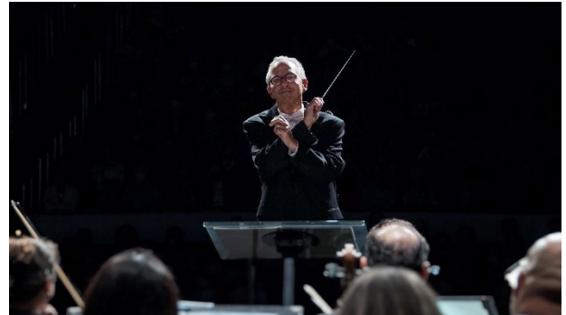
Punta Gorda Symphony highlights orchestral suites of great ballets on February 6 at the Charlotte Performing Arts Center.